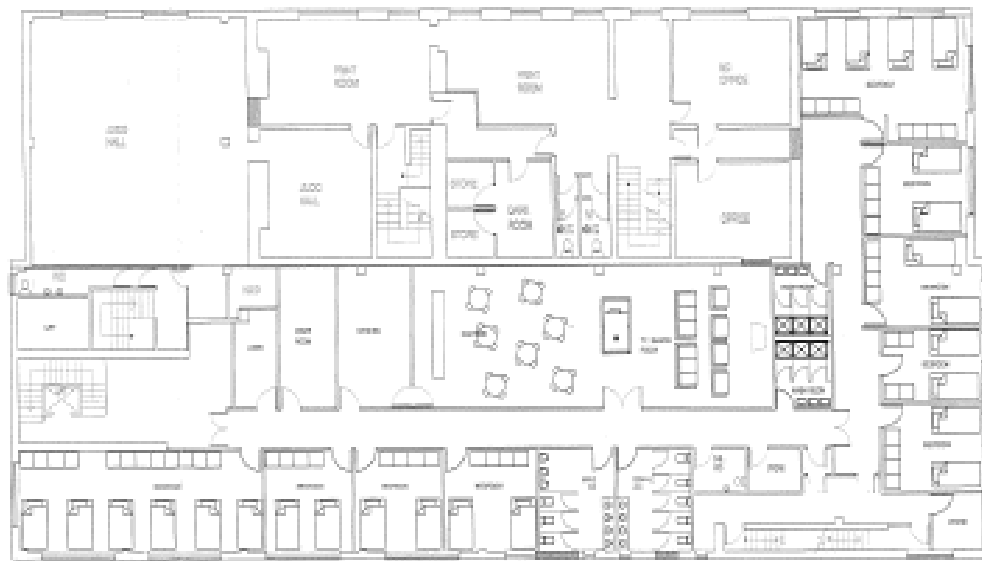
PROPOSED FIRST FLOOR HOTEL